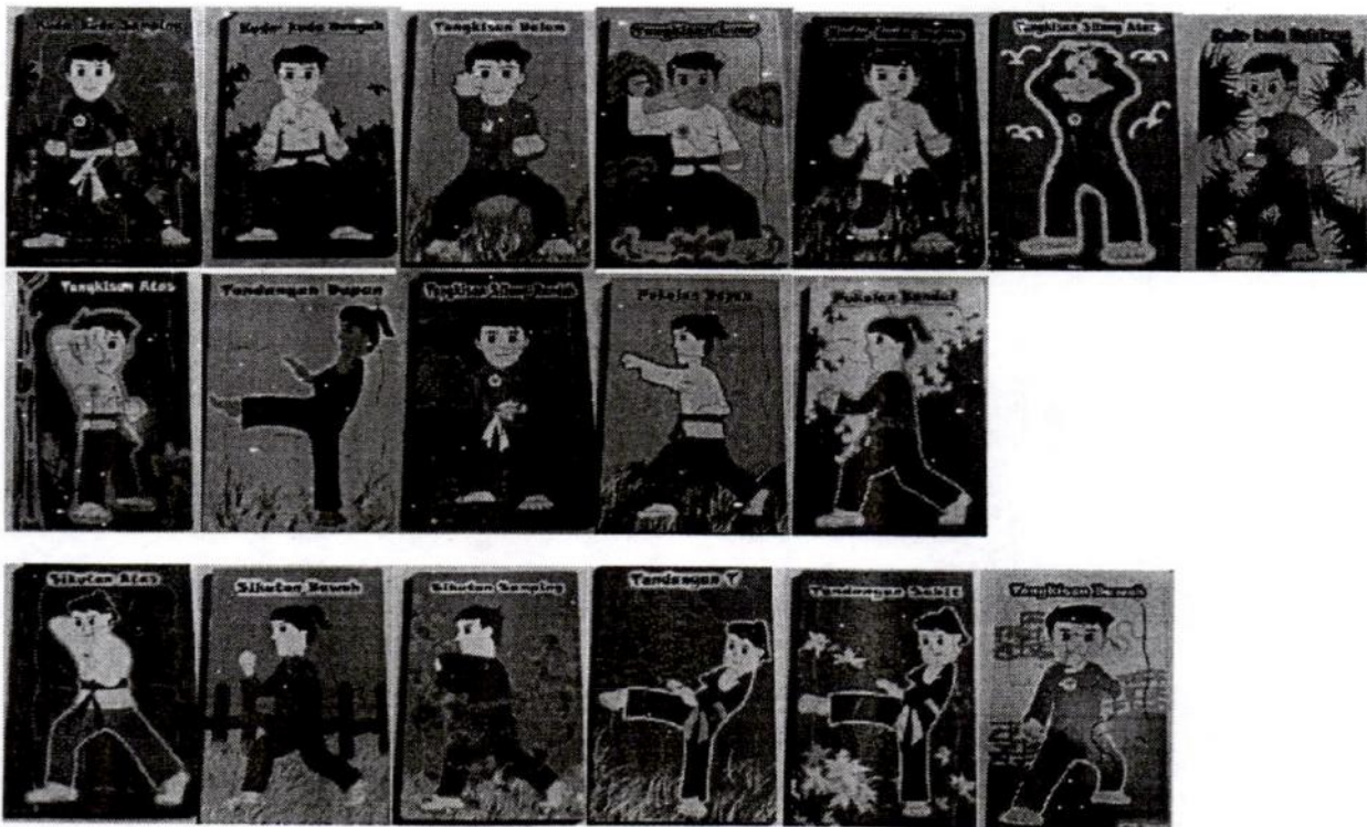
Picture. Puzzle display and coloring book After Final Revision